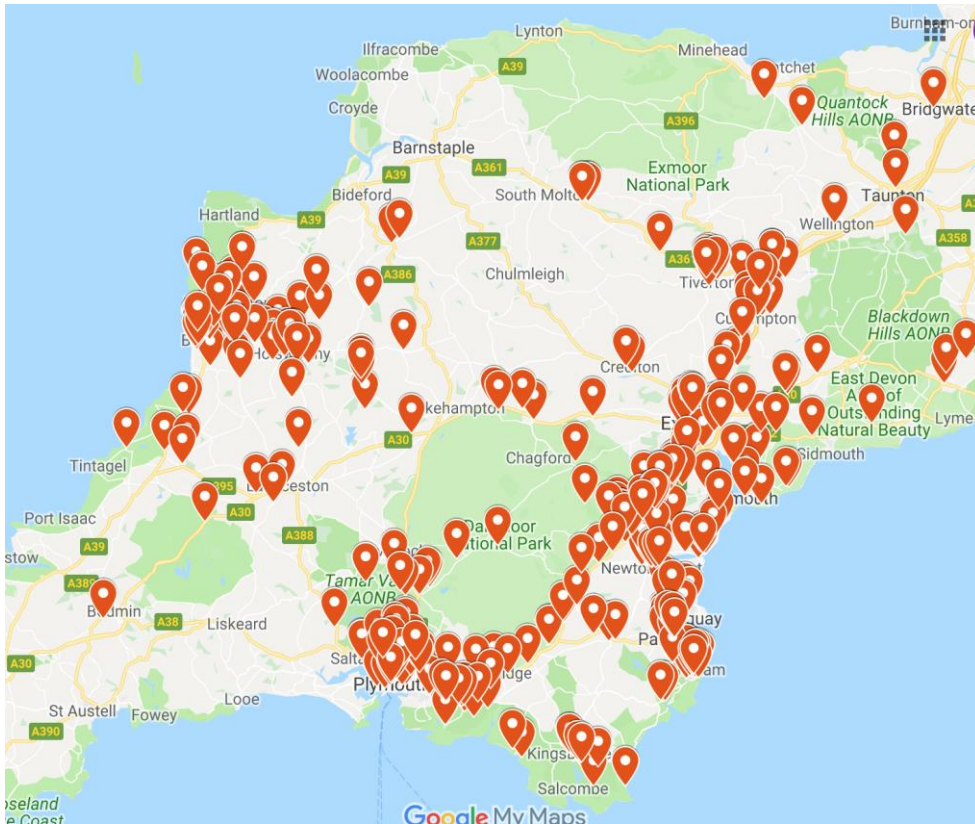
2018 activity map